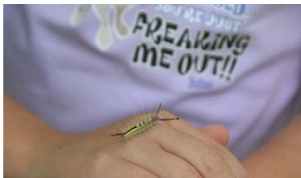
Everyone thought that our Chair screwed up royally when we were short of hot dog buns but actually the last bag contained this little guy.