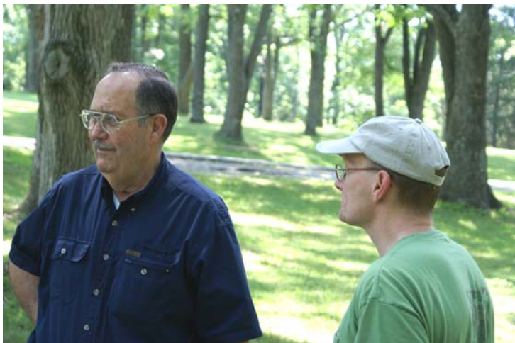
Why can't different generations ever see eye to eye?

On August 11 th , three dozen or so chemists and family members convened at John Bryan State Park to partake in food, drink, Frisbee, lethal lawn darts, soccer, water-gun fights, skinny-balloon sculpting, entomology, and battle-of-the-sexes corn hole.