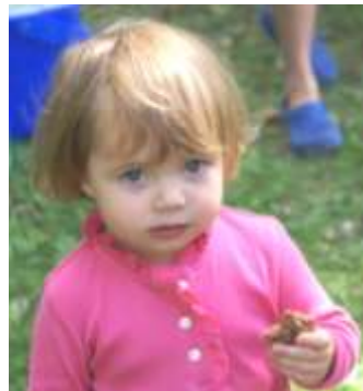
That is one sweet cookie!