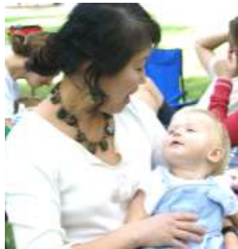
Hey! You're falling asleep while I'm talking to you!! Men are all alike!