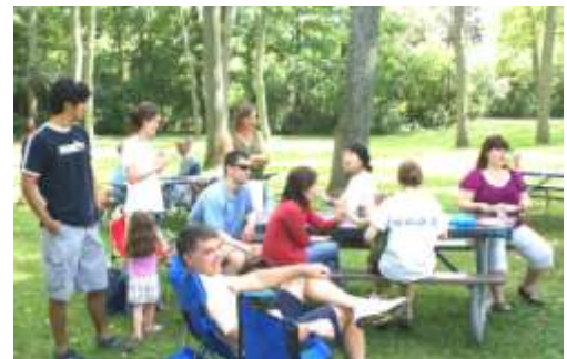
We're still waiting!