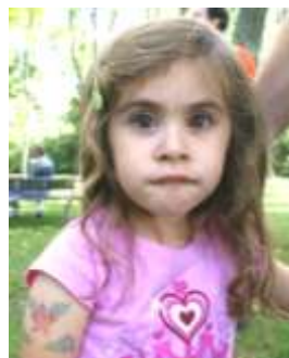
While paint-on tattoos are prized rewards for good behavior, it's hard to imagine what bad behaviors warrant body piercings.