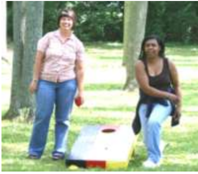
Coed Corn Hole! The fastest growing spectator sport in Ohio (due anticipated wardrobe malfunctions).