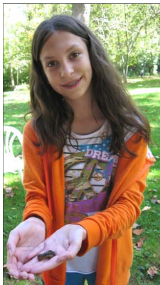
All grill requests were honored, no matter how bizarre.