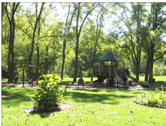
Magee Park was an idyllic retreat, at least until we unleashed our marauding gang of adolescents into it.