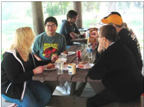
Good food and good company — well, one out of two ain't bad.

We had terrific weather and a great turnout at a wonderful new venue — Magee Park in Bellbrook. Perhaps even more members would have attended if the map in the Bulletin had been correct!