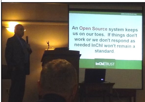
Why is it that your seat is always behind the guy with the biggest head?